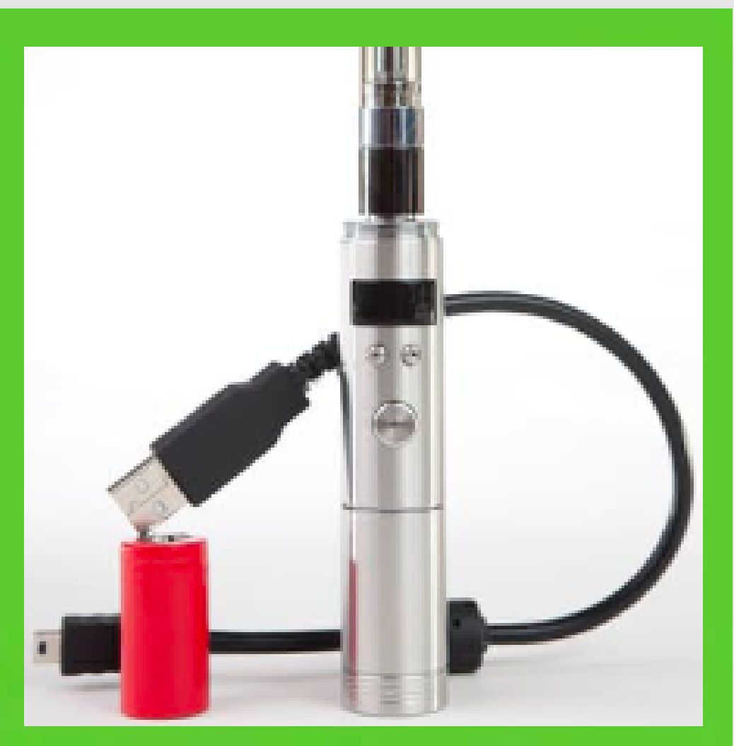
E-Cig Batteries/ Chargers