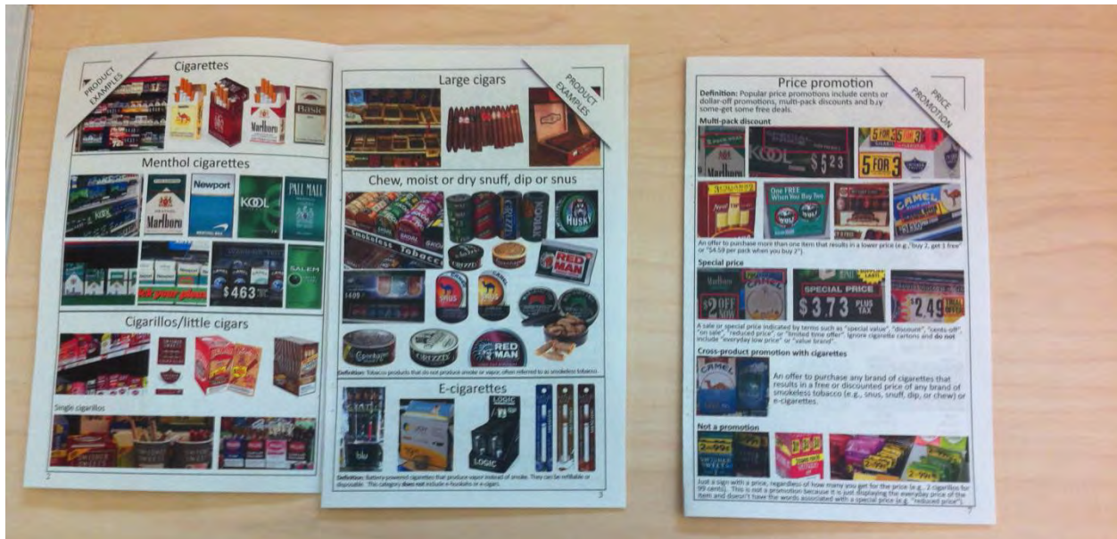
STEP #2: Open the front page of the Pocket Guide and insert page 3.