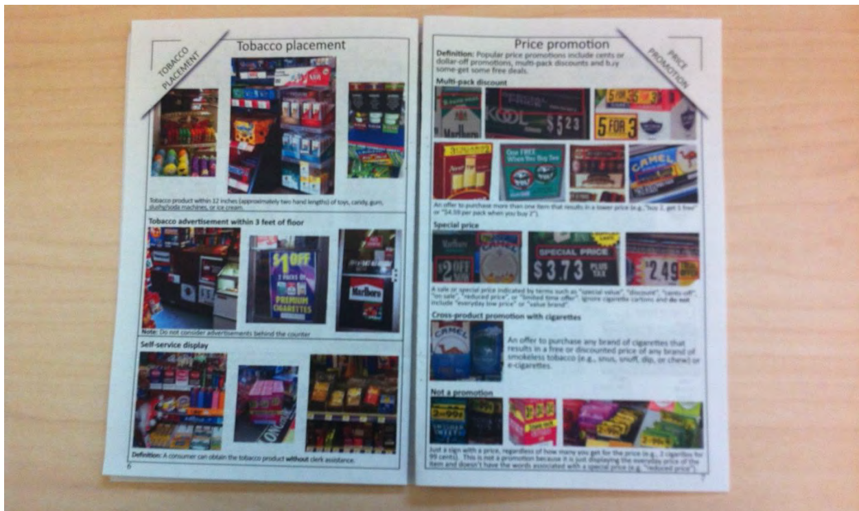
STEP #3: Turn the pages so that page 6 is on the left-hand side and insert page 7 in the booklet.